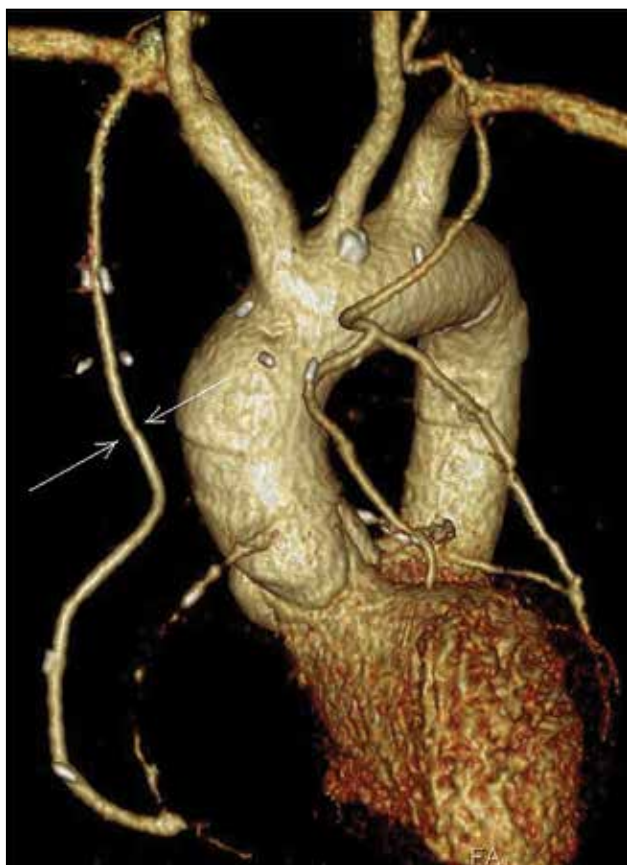
Fig. 3. Contrast-enhanced CT bypass angiography. Arrows indicate the end-to-end anastomosis of the vein and the stump of the right ITA

was assessed with the help of the VeriQ MediStim® flowmeter (Oslo, Norway) by the following parameters: volumetric velocity Q and resistance to blood flow – PI . The measurements were made during cardioplegic arrest after formation of each anastomosis at perfusion pressure of 45 mm Hg, after removing the clamp from the aorta, at the end of the operation immediately prior to bringing the sternal edges together at systemic pressure of 100–110 mm Hg [10, 11].