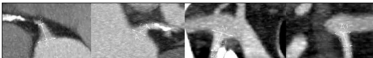
Fig. 1. Contrast-enhanced CT of the ostia of the left and right ITAs and CAs. A and A 1 – diameter of the ostium of the infundibular portion; B and B 1 – diameter of the tubular portion; C and C 1 – height of the infundibular portion of the CA and ITA, respectively